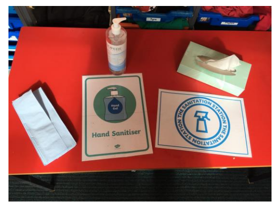
The School Day

Due to COVID-19, and in line with Government guidance, there will be four bubbles of children: